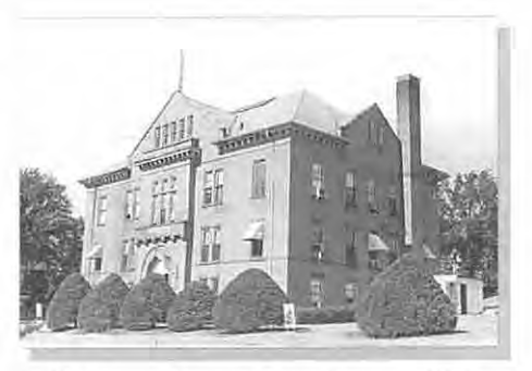
Big Stone County Courthouse, 1972

Reproduced by permission of Minnesota Historical Society